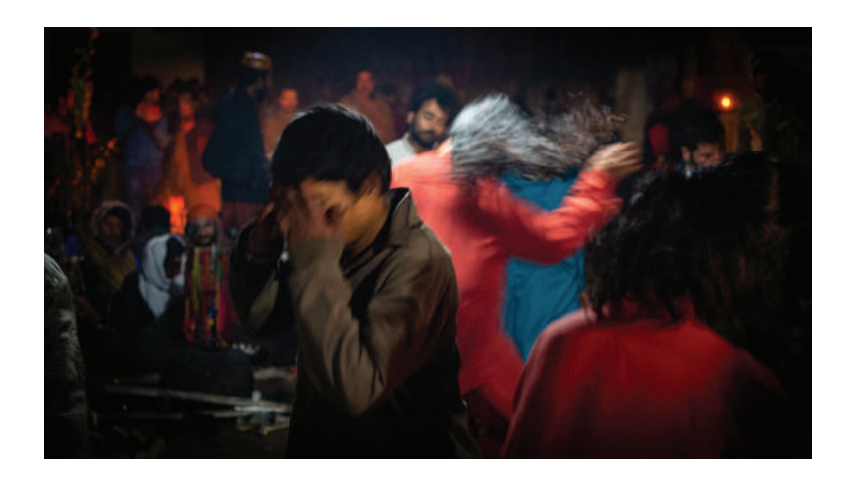
Riaz Mehmood, Ishq/Unconditional Love (detail), 2020. Video.

threatened by religious and cultural intolerance. Documentation and preservation become their own form of resistance in the face of a governmental program of Islamicization that narrows and demarcates the boundaries of accepted practice.